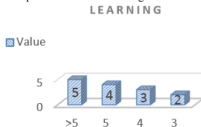
Figure 3. Learning criteria.

4.1.2. Learning criteria. Learning Criteria is the second criterion needed for decision making based on academic performance for Thesis Supervisors, Final Assistants (TA), Practical Work Guidance (KP) and Student Creativity Program (PKM) supervisors. Mapping the value of the learning criteria is presented on figure 3 where the explanation of the learning interval is explained as follows.