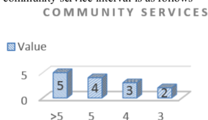
Figure 5. Devotion of the community.

4.1.4. Criteria for the number of services to the community. The next requirement is needed for decision making based on the large number of activities in the community service since it was determined as a permanent lecturer at UNIPMA. The criterion value data is presented in figure 5 where the description of the community service interval is as follows