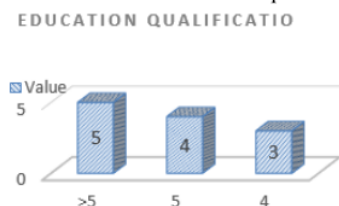
Figure 2. Education qualification.

4.1.1. Educational qualification criteria. Educational Qualification Criteria are the first criteria needed for decision making, based on educational qualifications with a 20% rating. Criteria value data are presented in figure 2 which is the interval of educational qualifications as follows.